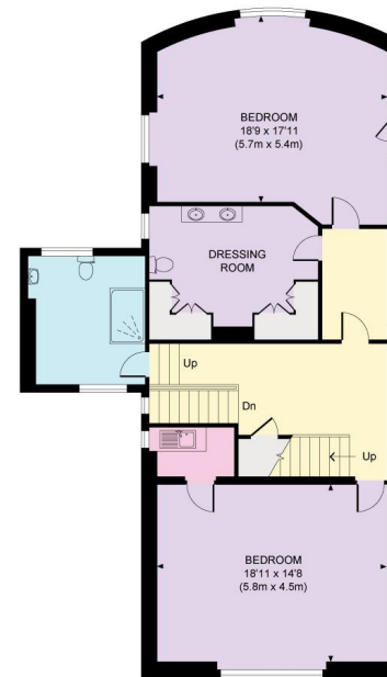
RAISED FIRST FLOOR