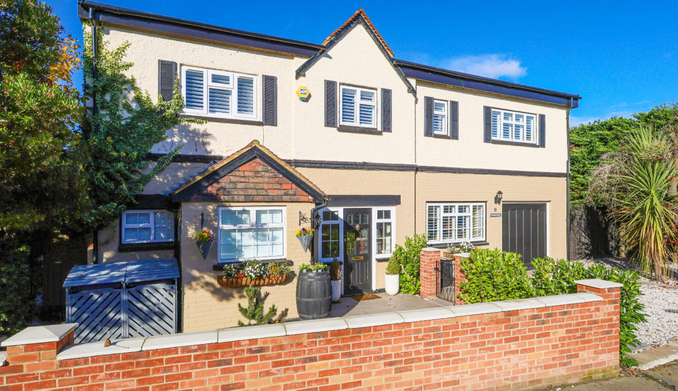
Castle Road, Weybridge