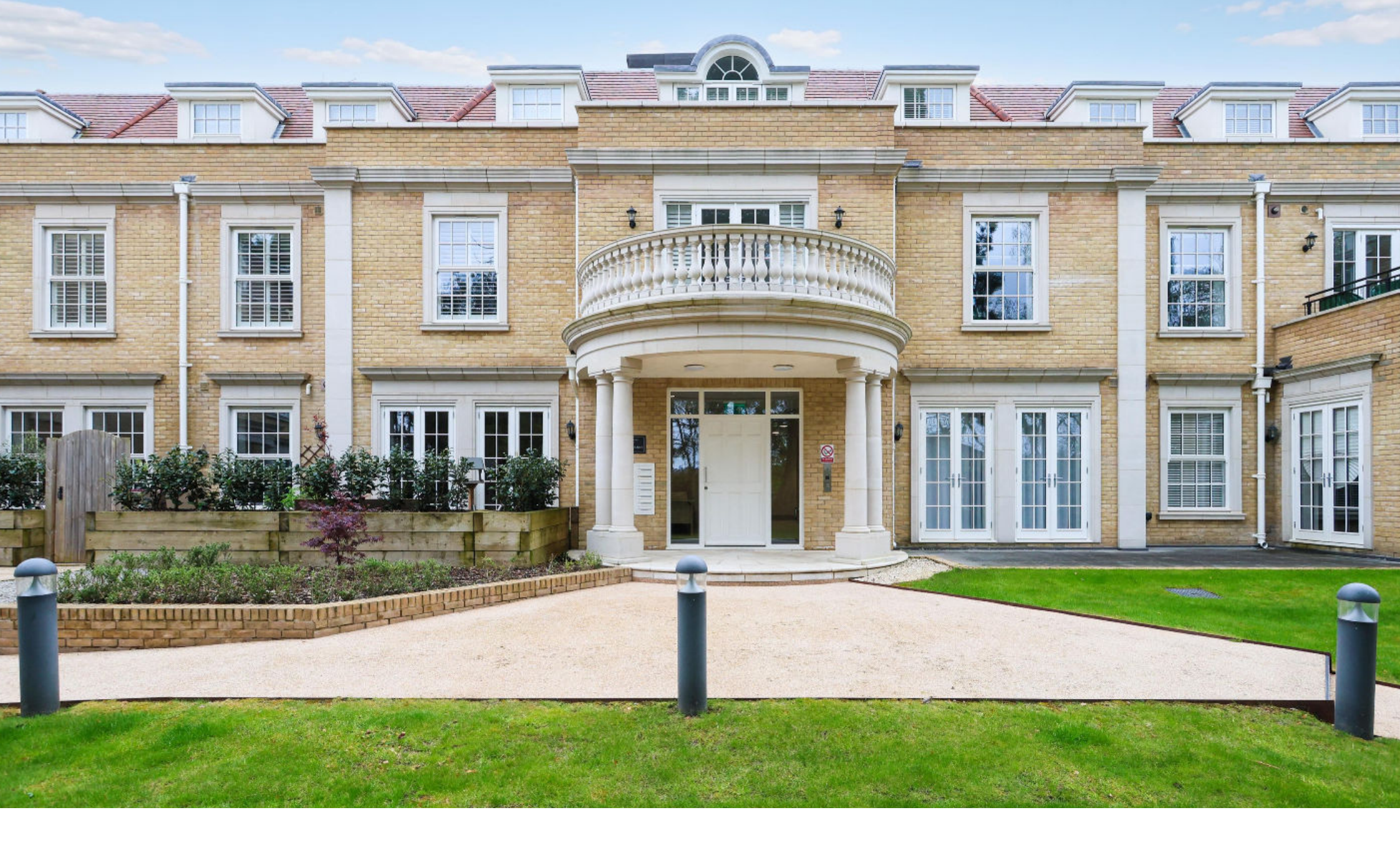
Brooklands Road, Weybridge