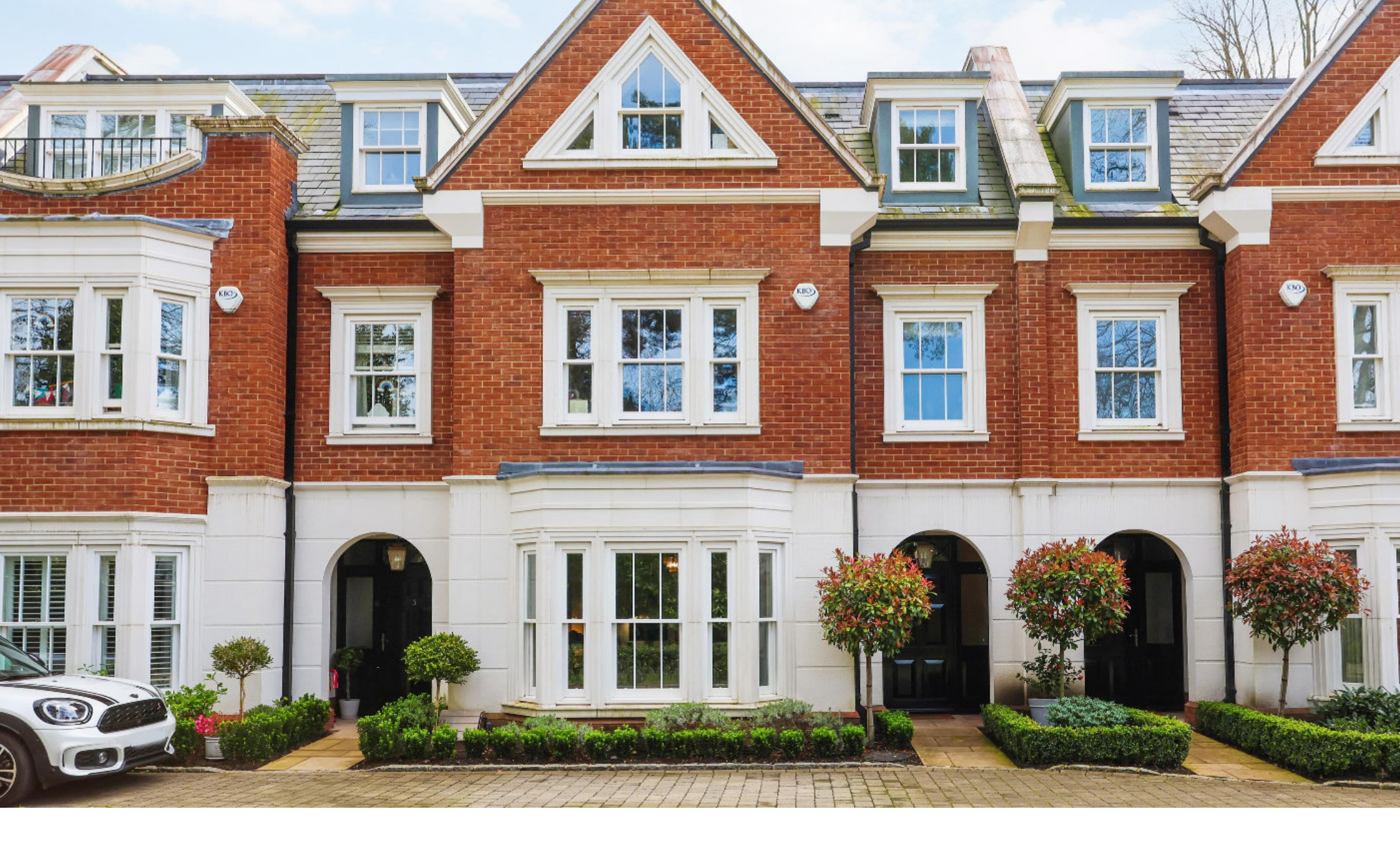
St. Marys Road, Weybridge