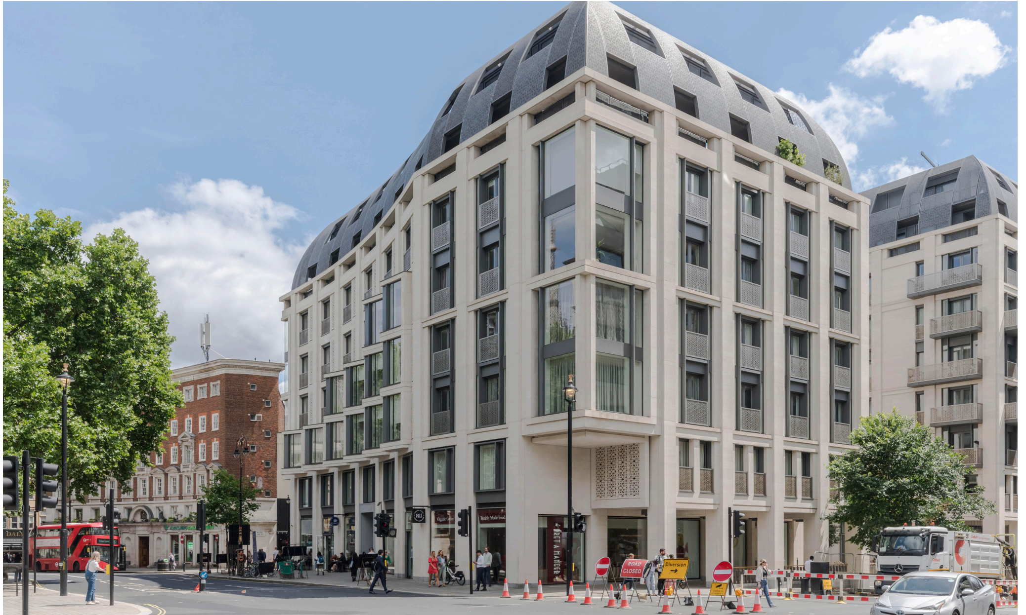
Milford House, The Strand WC2R