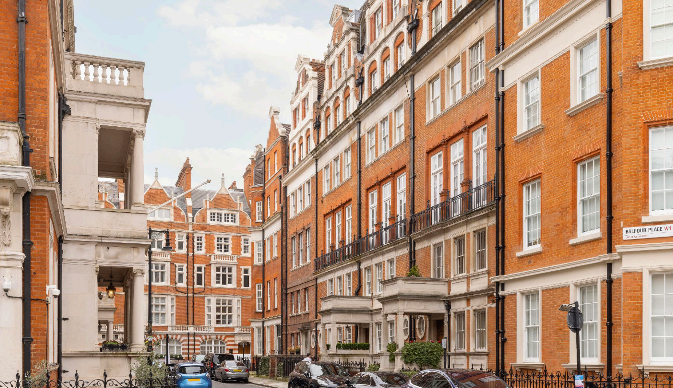
Balfour Place, Mayfair, London WIK