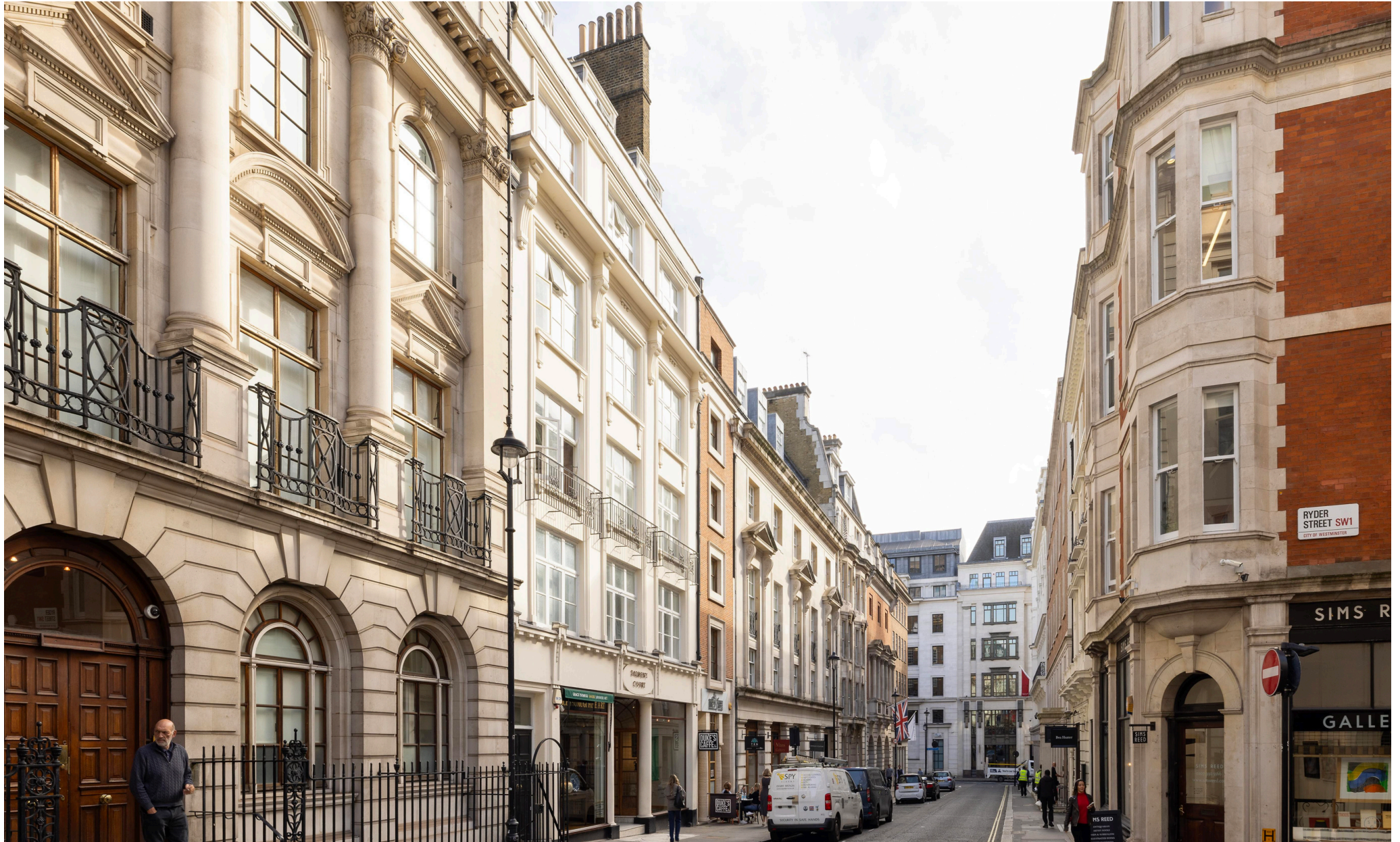
Dalmeny Court, Duke Street, St. James's SW1Y