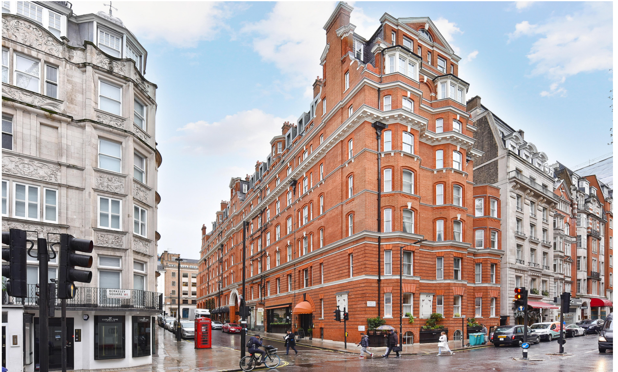
Berkeley House, Hay Hill, Mayfair WIJ