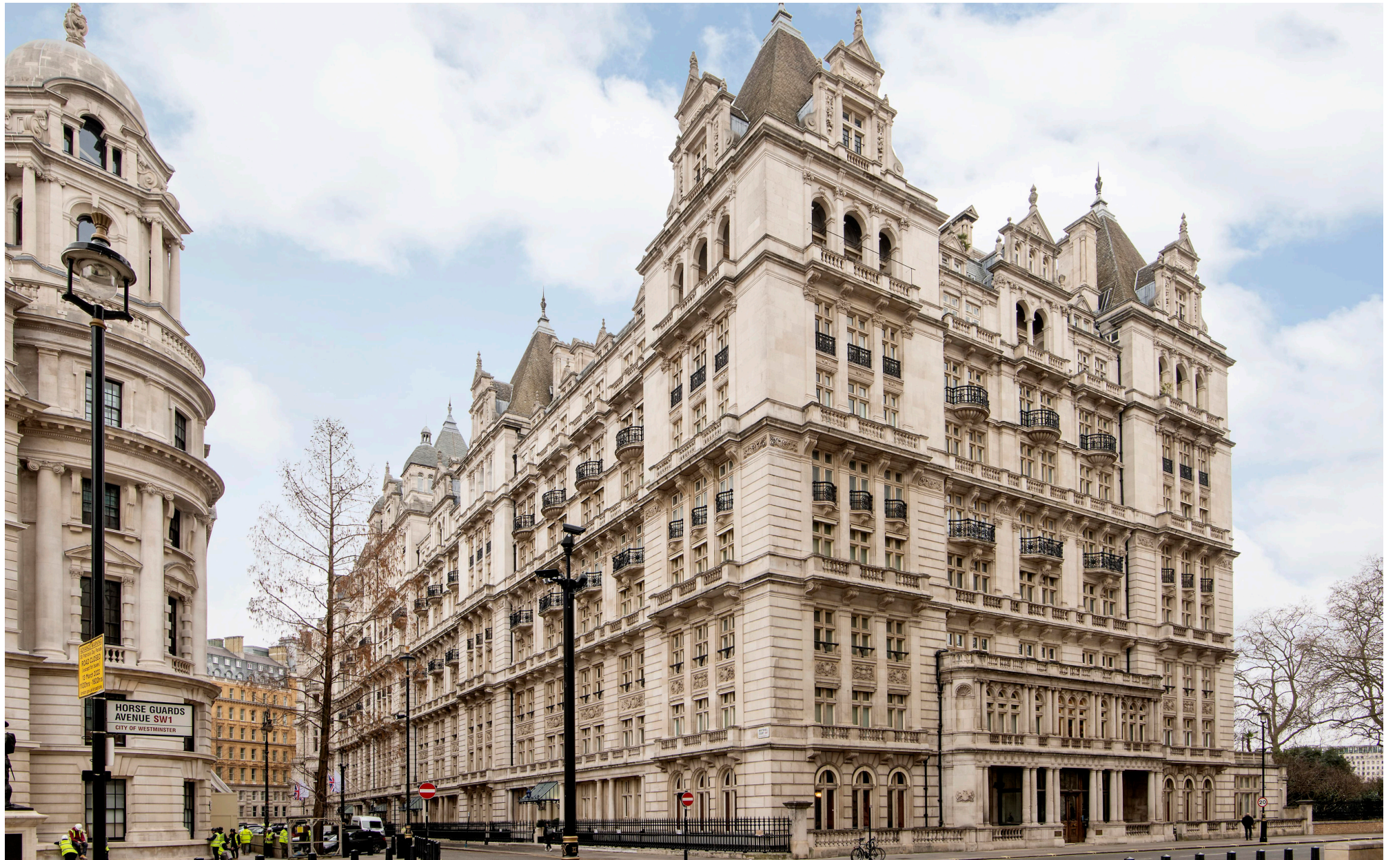
Whitehall Court, St James's, London SW1A