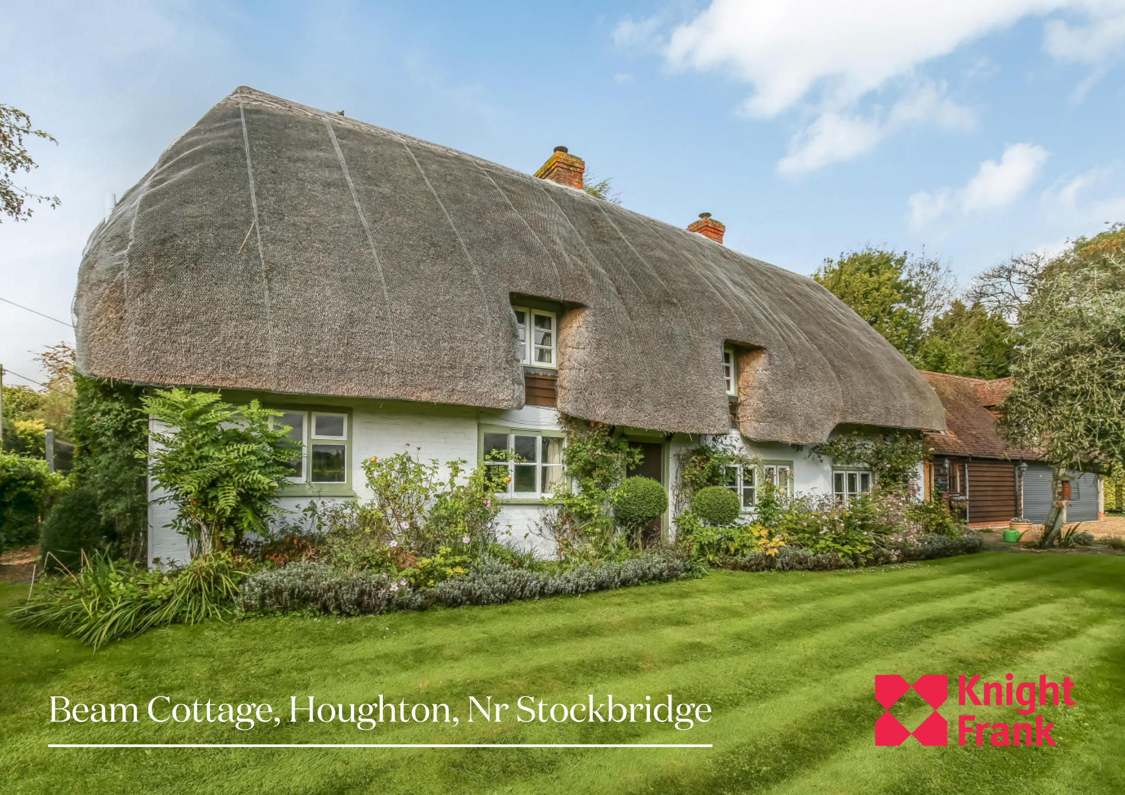
Beam Cottage, Houghton, Nr Stockbridge