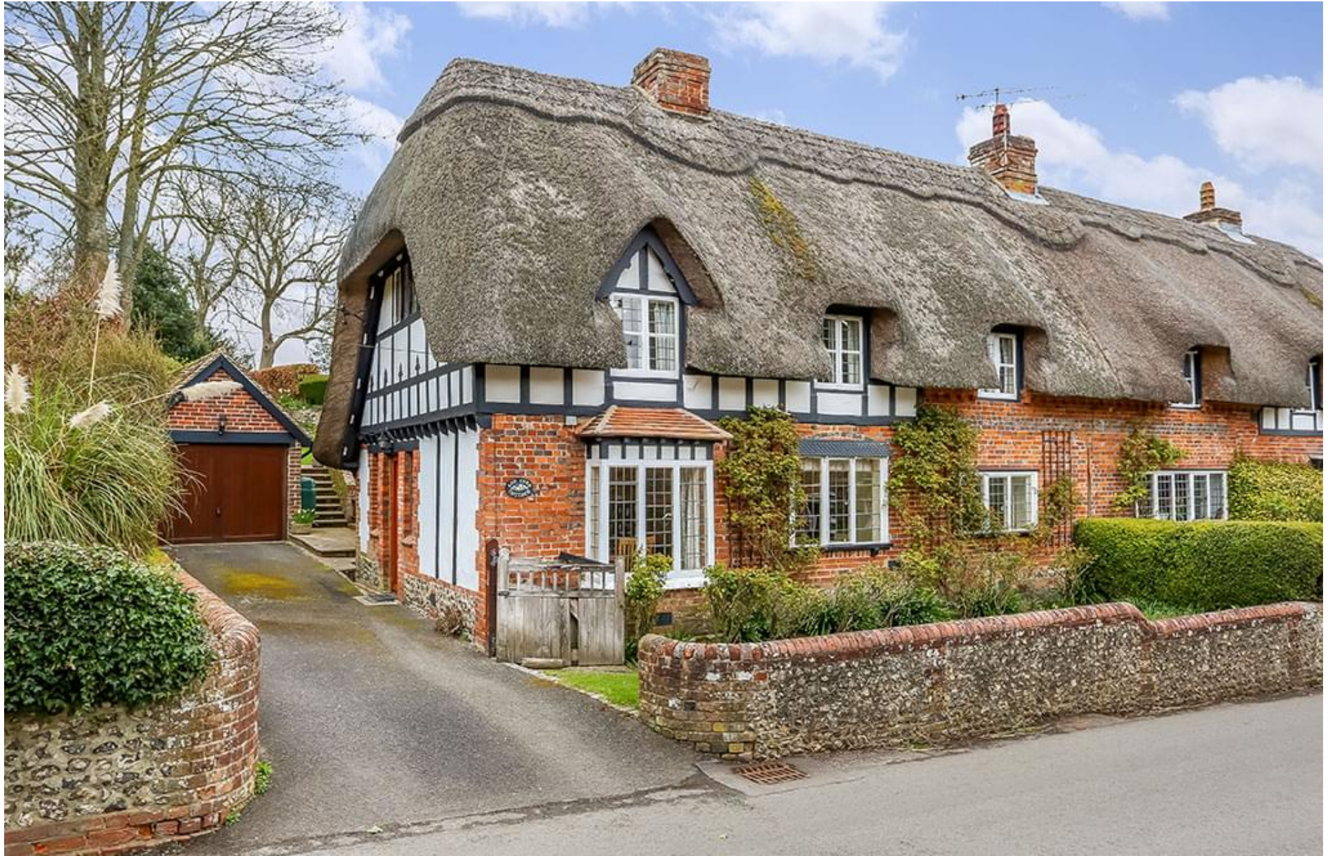
Ash Tree Cottage, Crawley, Hampshire