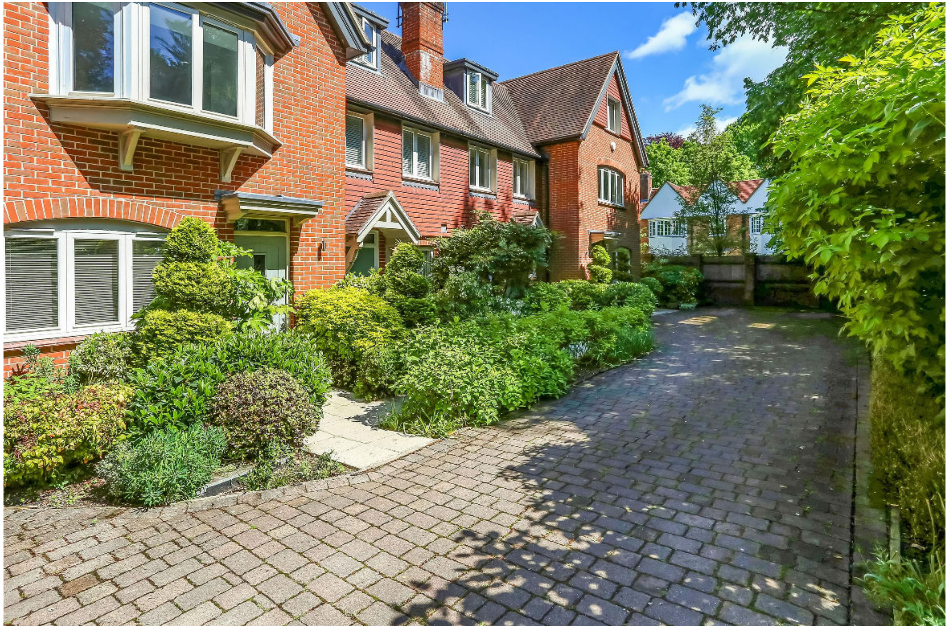
Pipers Gardens, Winchester, Hampshire