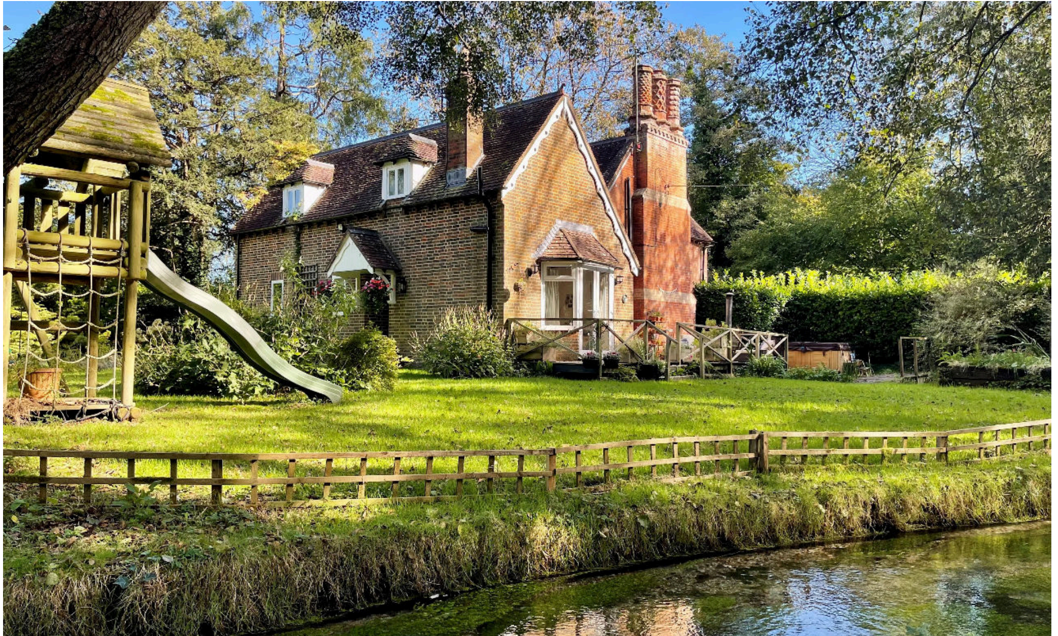
The Lodge, Nether Wallop