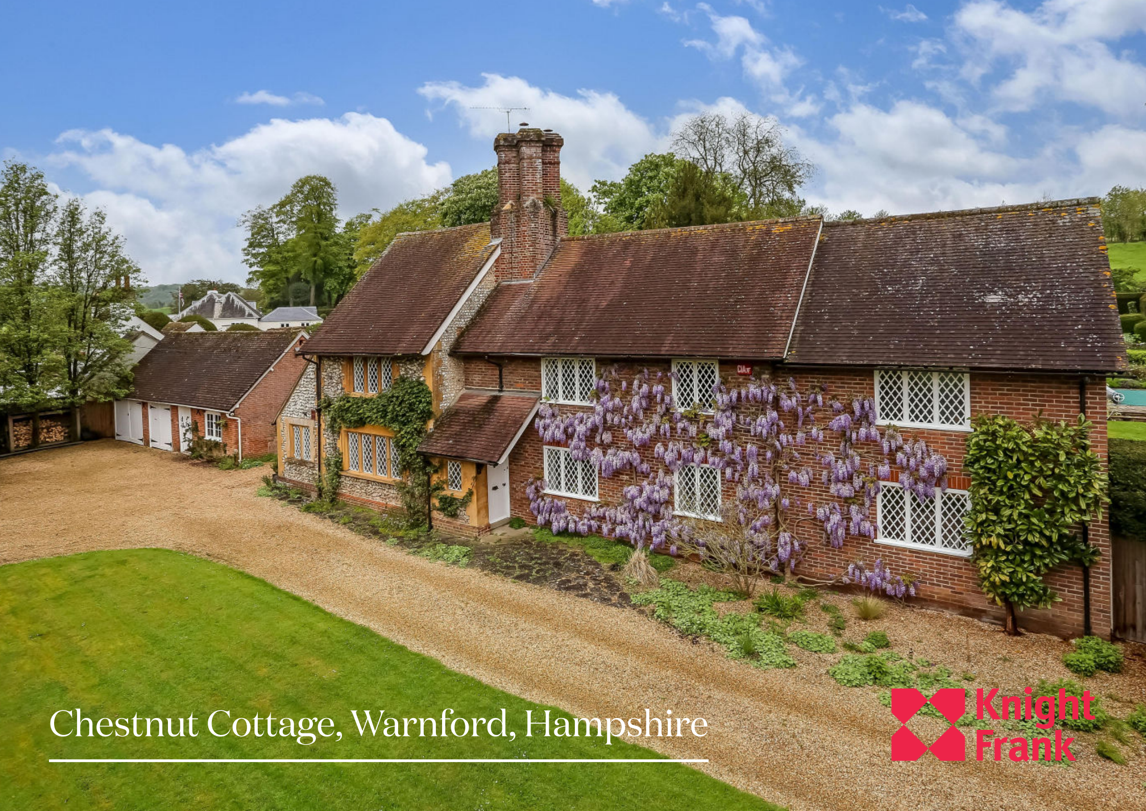
Chestnut Cottage, Warnford, Hampshire