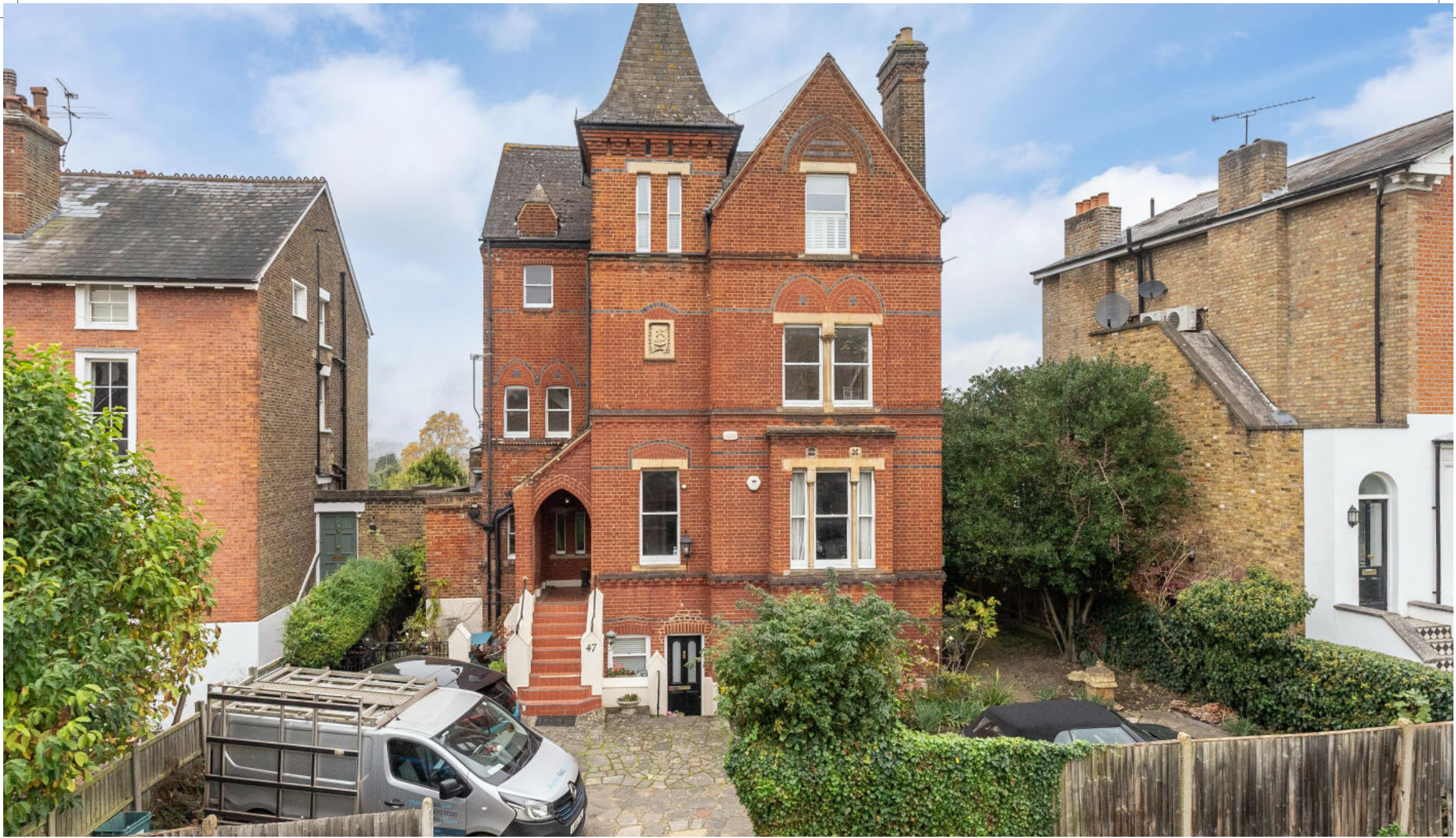
Crooked Billet, Wimbledon SW19