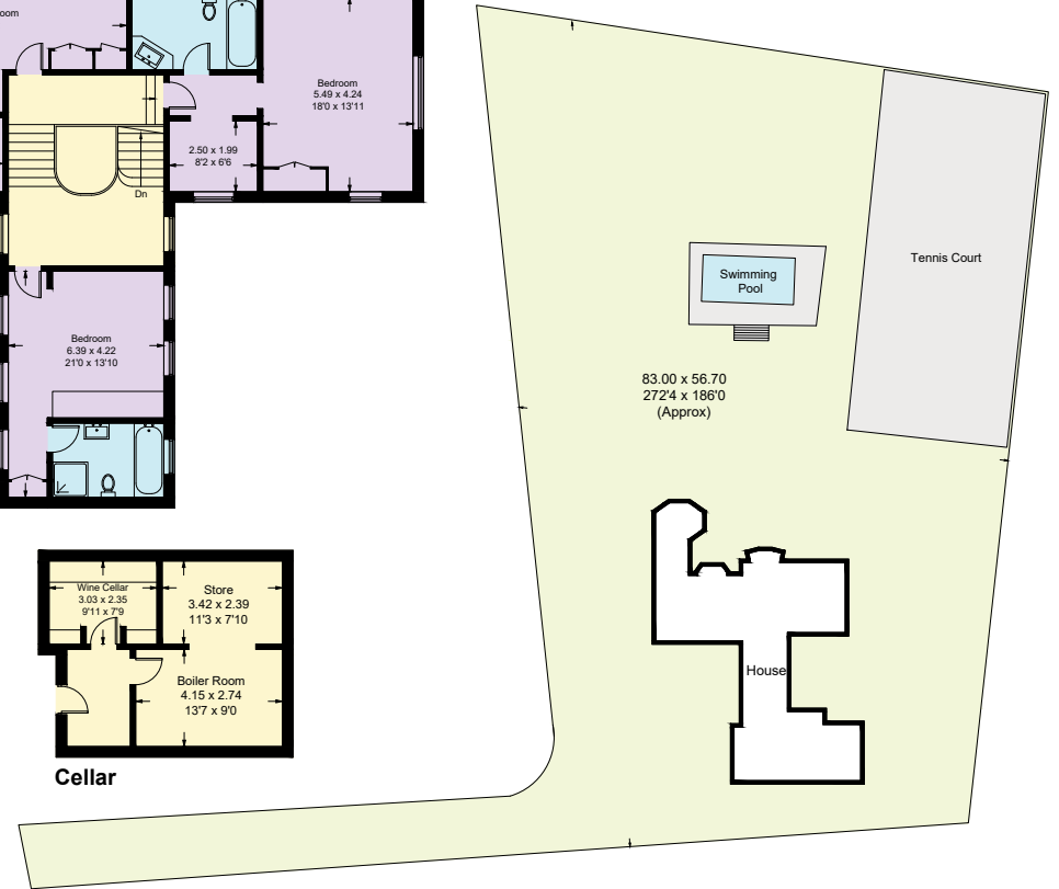
Illustration for identification purposes only, measurements are approximate, not to scale. Prepared for Knight Frank. (ID1169982)