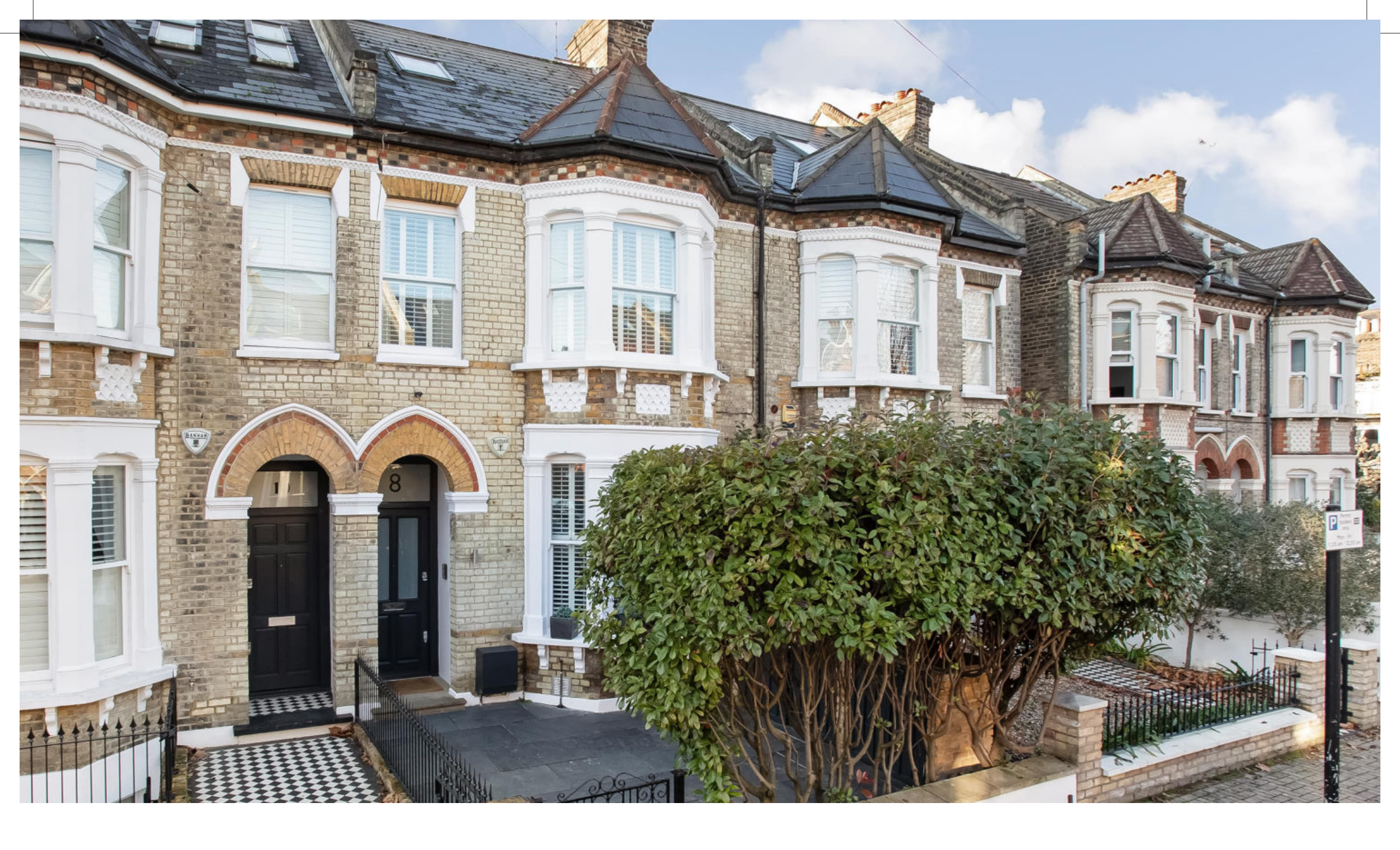
Ouseley Road, Wandsworth, London SW12