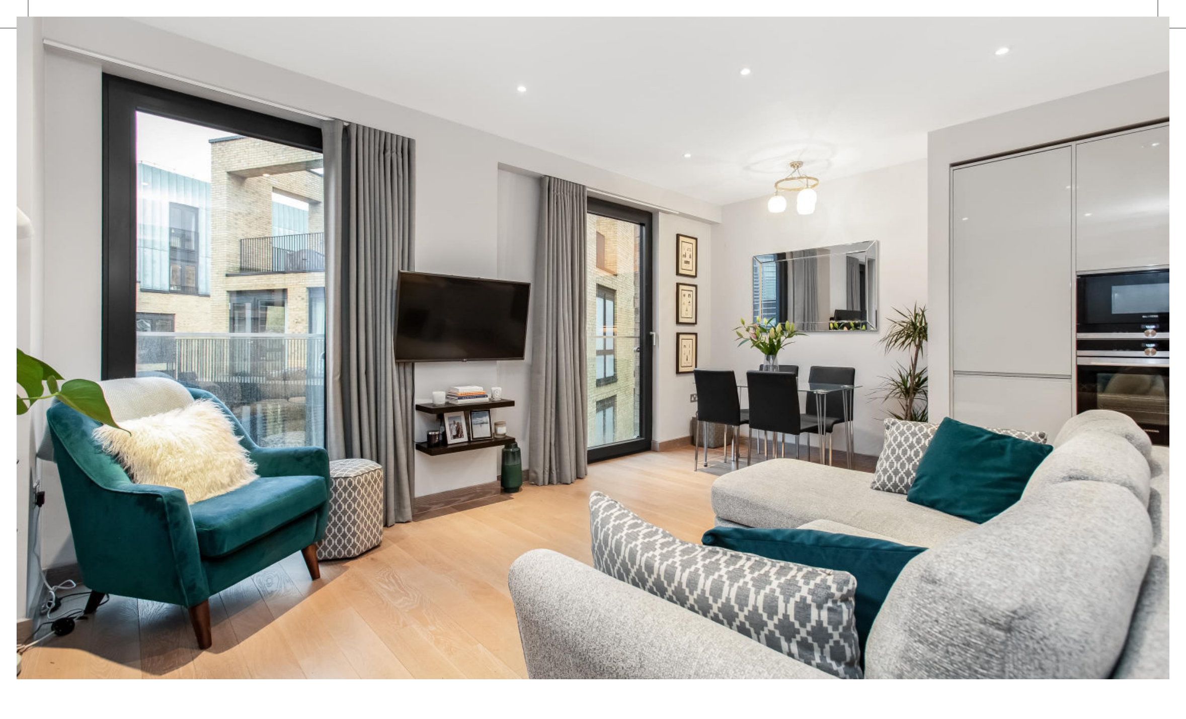
Ram Quarter, Wandsworth SW18