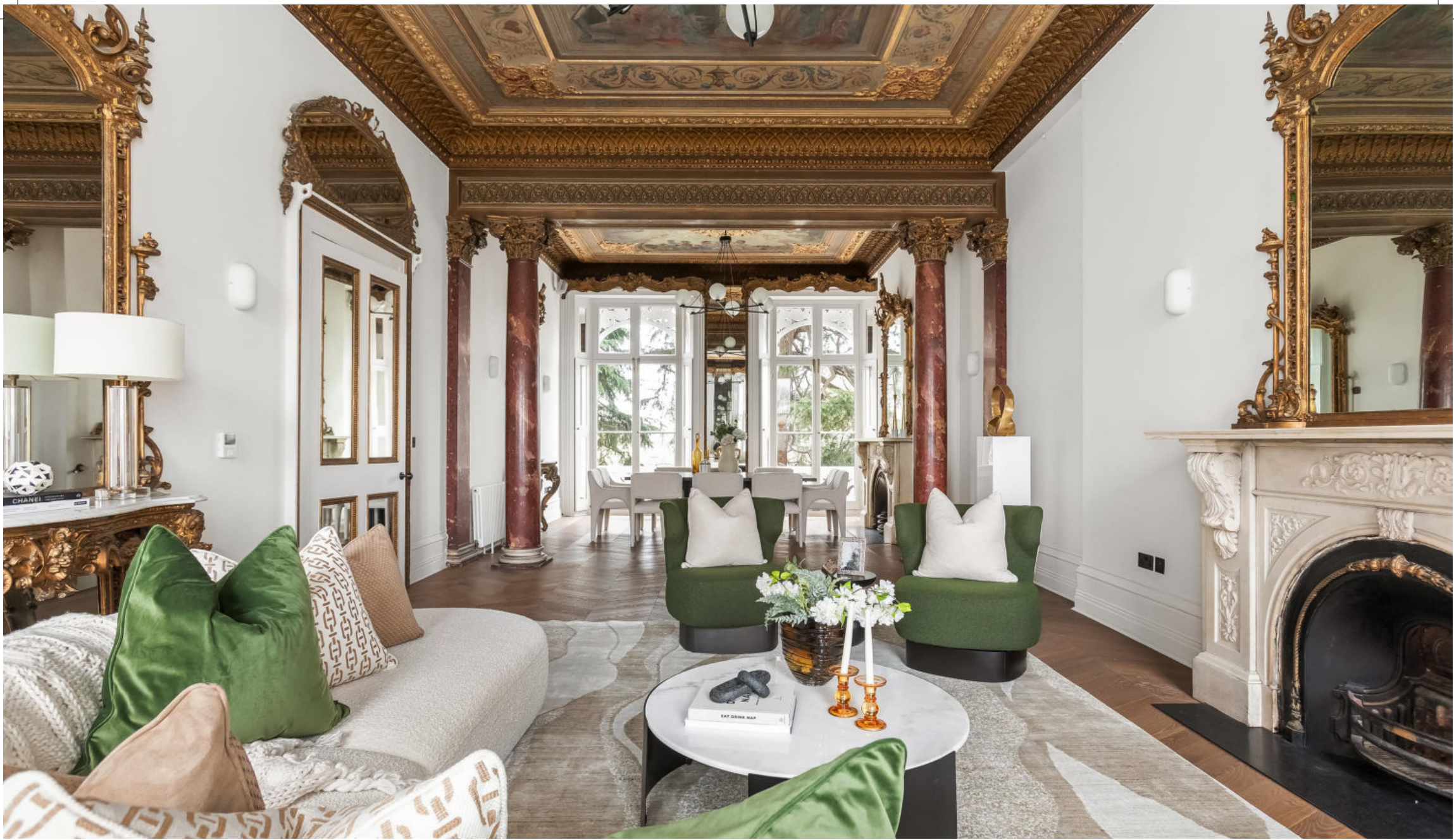
Clapham Common North Side, London SW4