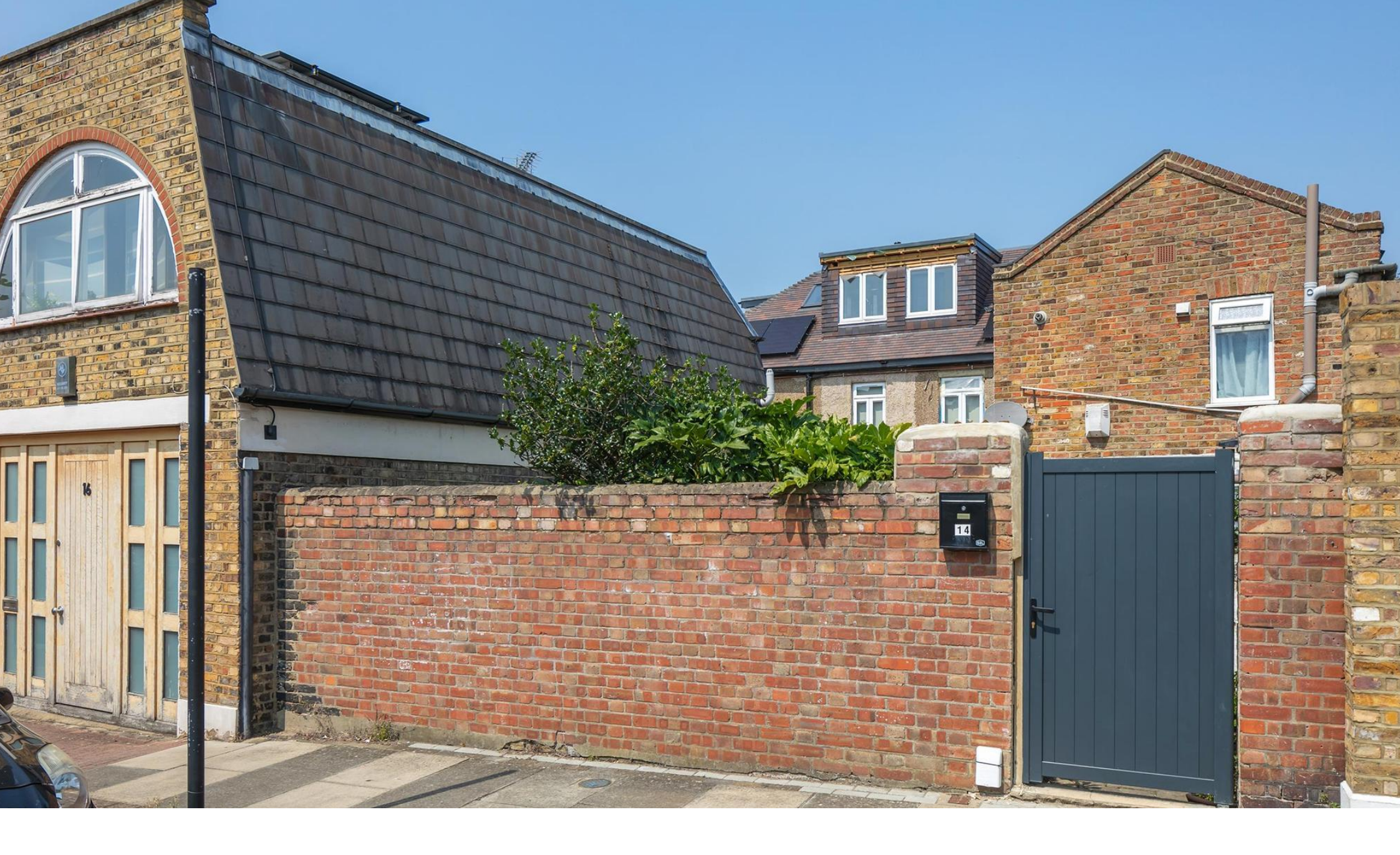
Cader Road, London SW18