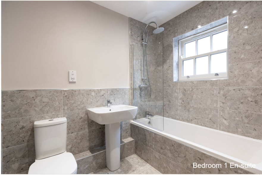
Bedroom 1 En-suite