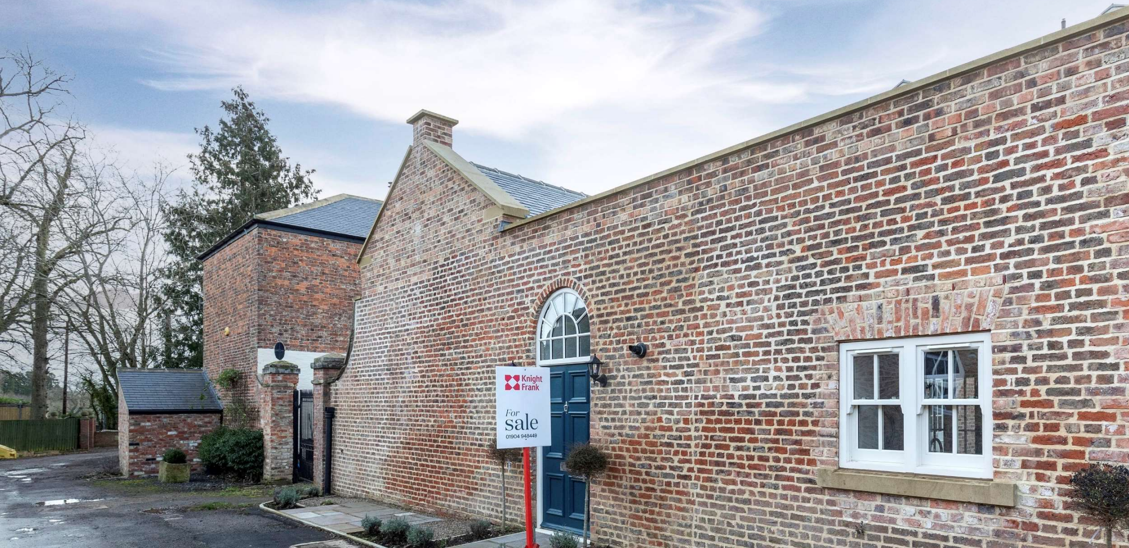
Dinsdale Hall, Middleton St. George, Darlington, Durham DL2