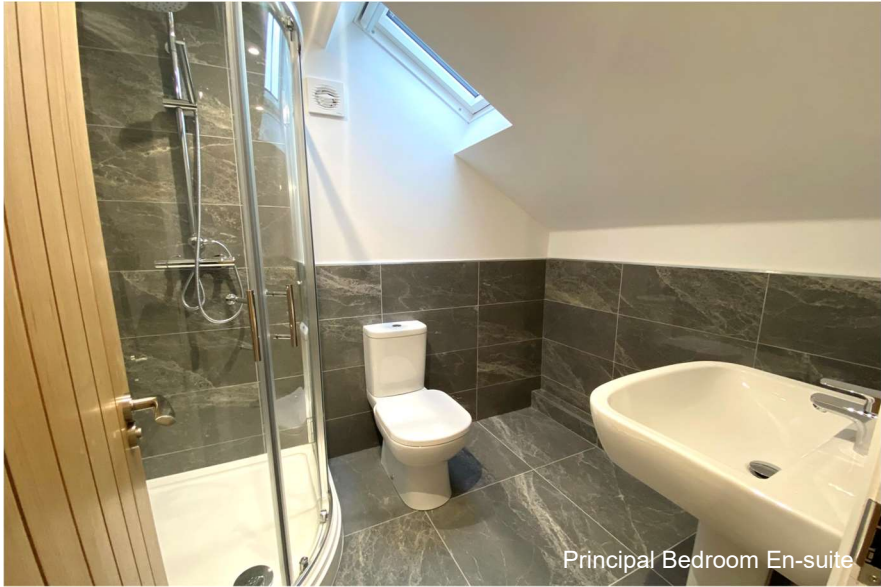
Principal Bedroom En-suite