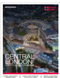
Central London Quarterly Q2 2018