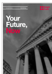
Retail Banking Sector Overview