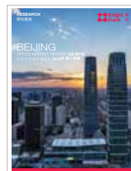
Beijing Office Market Q2 2018