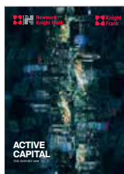
Active Capital 2018