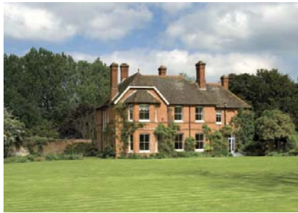
Sought after village house Child Okeford, Dorset Sold