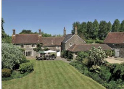
Grade II delight Stalbridge, Dorset Sold