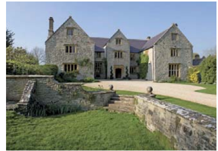
Historic Manor House Fivehead, Somerset Sold