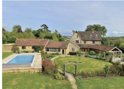
Fine farmhouse Wyke Champflower, Somerset Sold