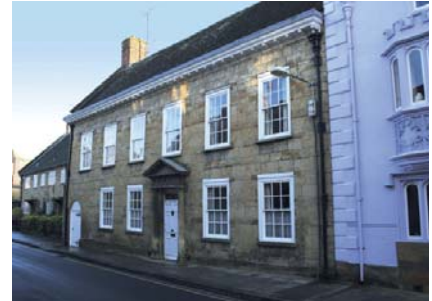
Elegant townhouse Sherborne, Dorset Sold