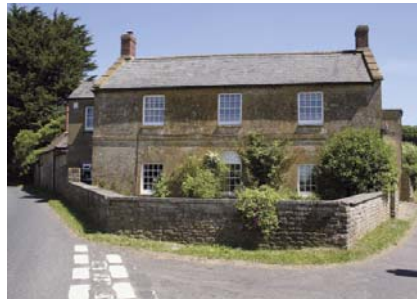
Sold within 10 days Charlton Horethorne, Dorset Sold