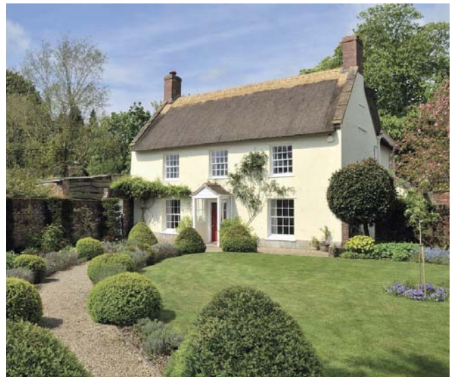
CERNE RIVER COTTAGE

£765,000. We immediately arranged a number of viewings and received an offer in line with the guide price from the first viewers. This was followed by a higher offer and a competitive bidding situation arose. We went to 'best offers' after ten days on the market. This resulted in an excellent response and the price achieved was considerably higher than the guide price. Considering the unstable nature of the market at the time, this was a fantastic result and the clients were delighted with our achievement.