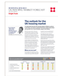
UK Housing Market Forecast Q4 2011

Knight Frank Research Reports are available at www.KnightFrank.com/Research