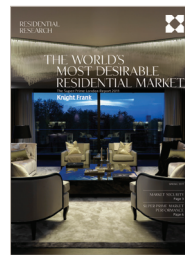
Super-Prime London Report 2011