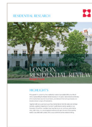
The London Review Autumn 2011