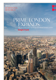
City of London and City Fringe 2011/12