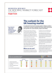
UK Housing Market Forecast Q4 2011

Knight Frank Research Reports are available at www.KnightFrank.com/Research