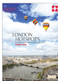
London Hotspots 2011