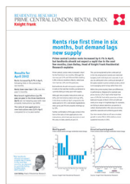
Prime Central London Rental Index April 2012