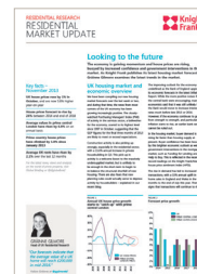
UK Residential Market Update November 2013