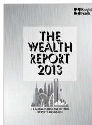
The Wealth Report 2013