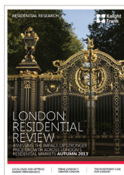
London Review Autumn 2013