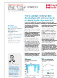
Prime Central London Rental Index Nov 2013