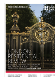
London Review Autumn 2013