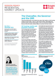
UK Residential Market Update December 2013