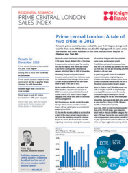
Prime Central London Sales Index Dec 2013

Knight Frank Research Reports are available at www.KnightFrank.com/Research