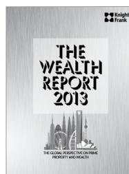
The Wealth Report 2013