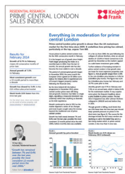
Prime Central London Sales Index Feb 2014

Knight Frank Research Reports are available at KnightFrank.com/Research