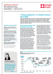
UK Residential Market Update February 2014