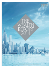
The Wealth Report 2014