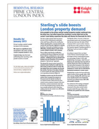
Prime Central London Sales Index Jan 2013

Knight Frank Research Reports are available at www.KnightFrank.com/Research