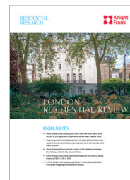
London Review Spring 2013