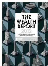
The Wealth Report 2012