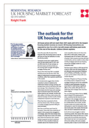
UK Housing Market Forecast 2012