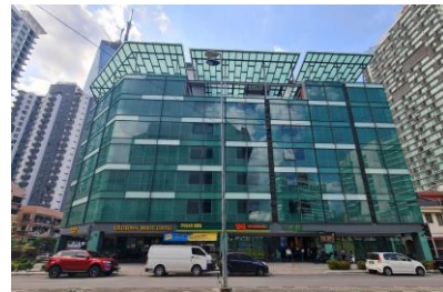
KLEight, Kuala Lumpur Tenure: Freehold No. of Rooms: 33 keys