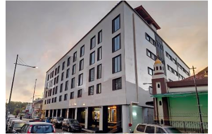
Loop on Leith, Georgetown Tenure: Freehold No. of Rooms: 140 keys