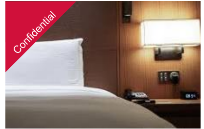
Award Winning Lifestyle Hotel, Melaka Tenure: Freehold No. of Rooms: 60 keys