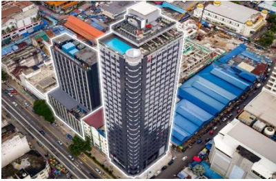
Hilton Garden Inn Kuala Lumpur Tenure: Freehold No. of Rooms: 532 keys