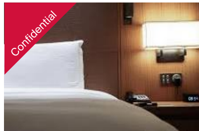
Confidential, Kuala Lumpur Tenure: Freehold No. of Rooms: 253 keys