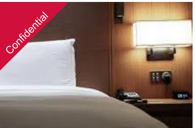
Confidential, Kuala Lumpur Tenure: Freehold No. of Rooms: 210 keys