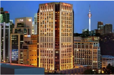
Sheraton Imperial Kuala Lumpur Tenure: Freehold No. of Rooms: 398 keys