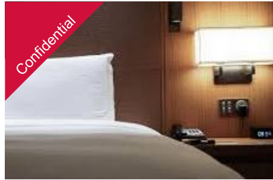
Confidential 5-star Hotel, Penang Tenure: Freehold No. of Rooms: 316 keys