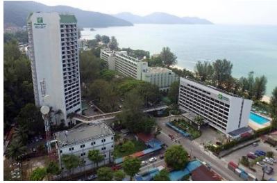
Former Holiday Inn Resort Penang Tenure: Freehold No. of Rooms: 361 keys