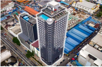
Hilton Garden Inn Kuala Lumpur