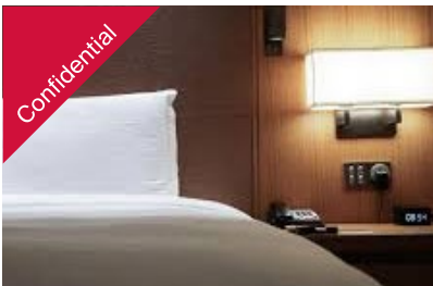
Confidential 5-star Hotel, Penang