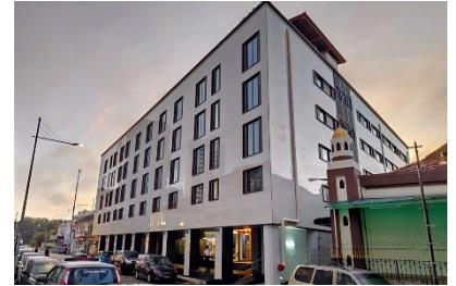
Loop on Leith, Georgetown