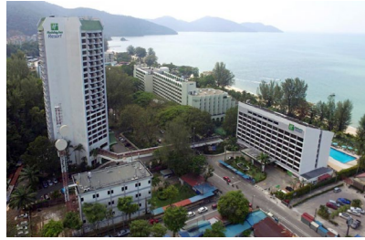
Former Holiday Inn Resort Penang