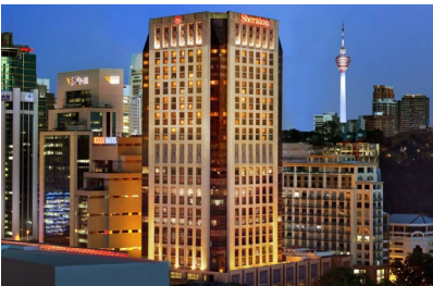
Sheraton Imperial Kuala Lumpur