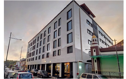
Loop on Leith, Georgetown