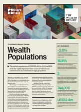
The Wealth Report – Wealth Sizing Report