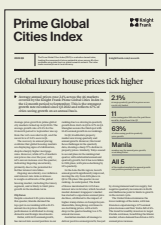
Prime Global Cities Index Q3 2023