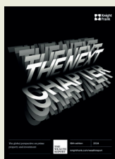
The Wealth Report 2024