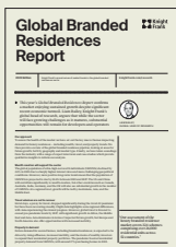
Global Branded Residences Report 2023

Keep up to speed with global property markets with our range of dedicated sector newsletters