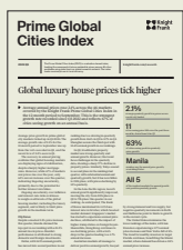
Prime Global Cities Index Q3 2023