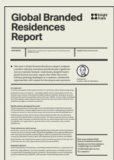
Global Branded Residences Report 2023

Keep up to speed with global property markets with our range of dedicated sector newsletters