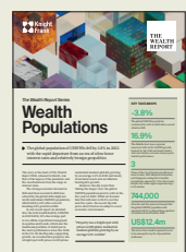
The Wealth Report – Wealth Sizing Report