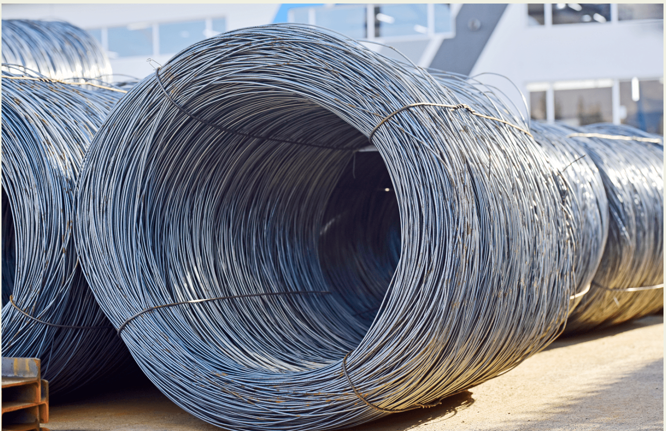
Some of the products from Nalukolongo industrial area

Agro-processing firms also find a home here, benefiting from proximity to agricultural sources and access to urban markets. Additionally, logistics and distribution centers thrive due to expanded road networks and modern warehousing facilities. Construction and engineering companies are drawn to Nalukolongo for its supportive environment and opportunities for infrastructure development. Emerging sectors like renewable energy and environmental technologies are poised to grow, driven by increasing demands for sustainable practices. With a mix of existing industries and ongoing developments, the Nalukolongo Industrial Area offers a dynamic ecosystem conducive to innovation, growth, and strategic business expansion.