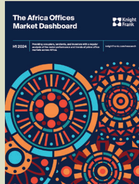
Africa Offices Market Dashboard H1 2024