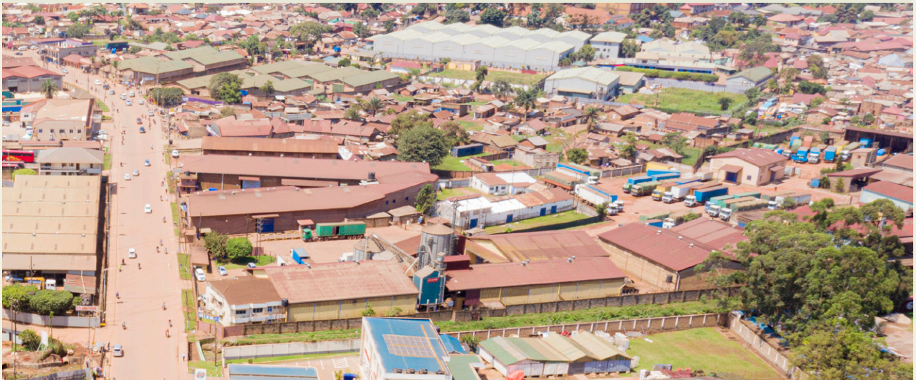
A section of Nalukolongo Industrial Area showing industrial developments