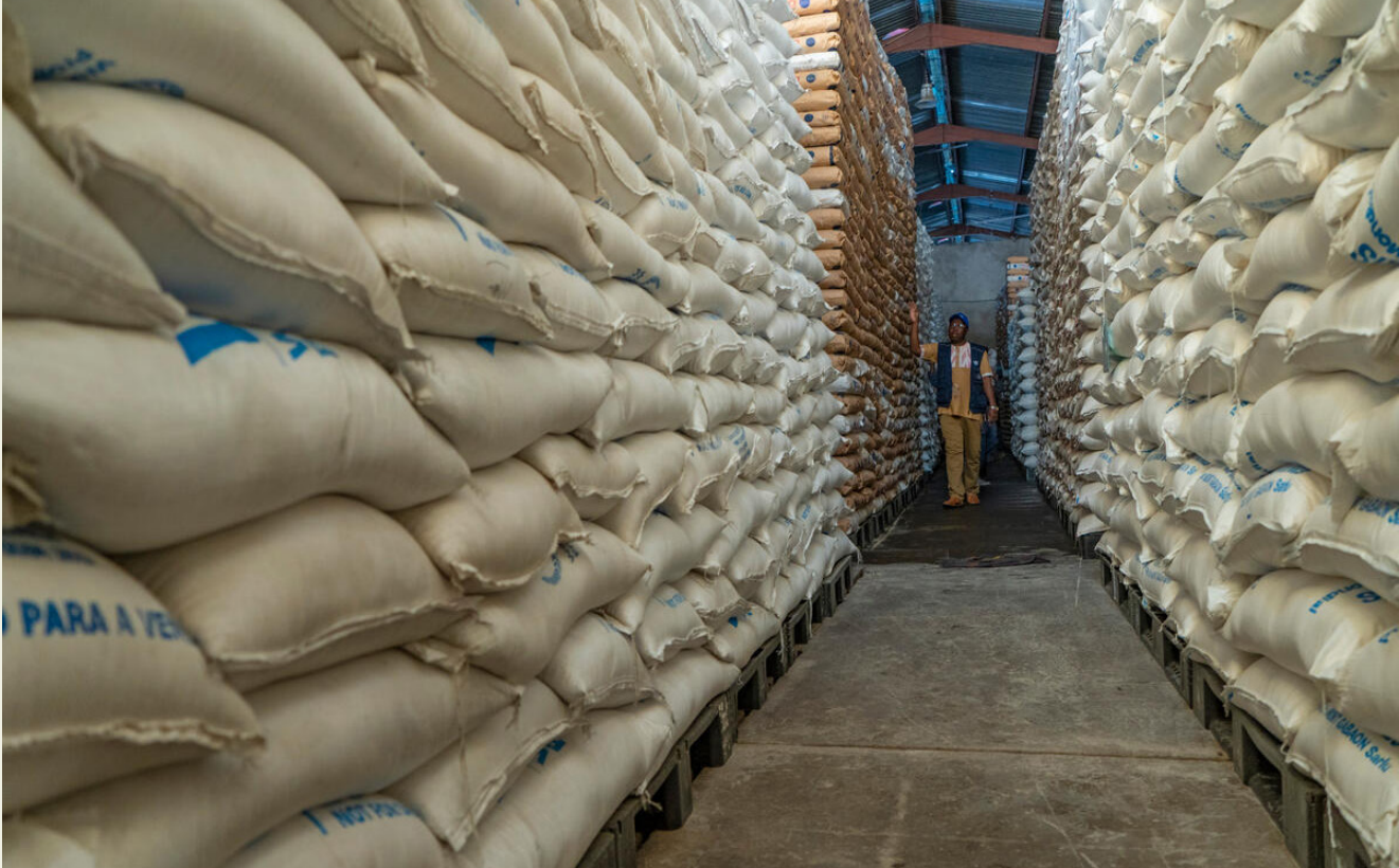
World Food Programme Warehouse - Nalukolongo