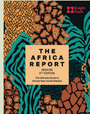
The Africa Report 2024/25 6 TH EDITION The Ultimate Guide to Africa's Real Estate Markets