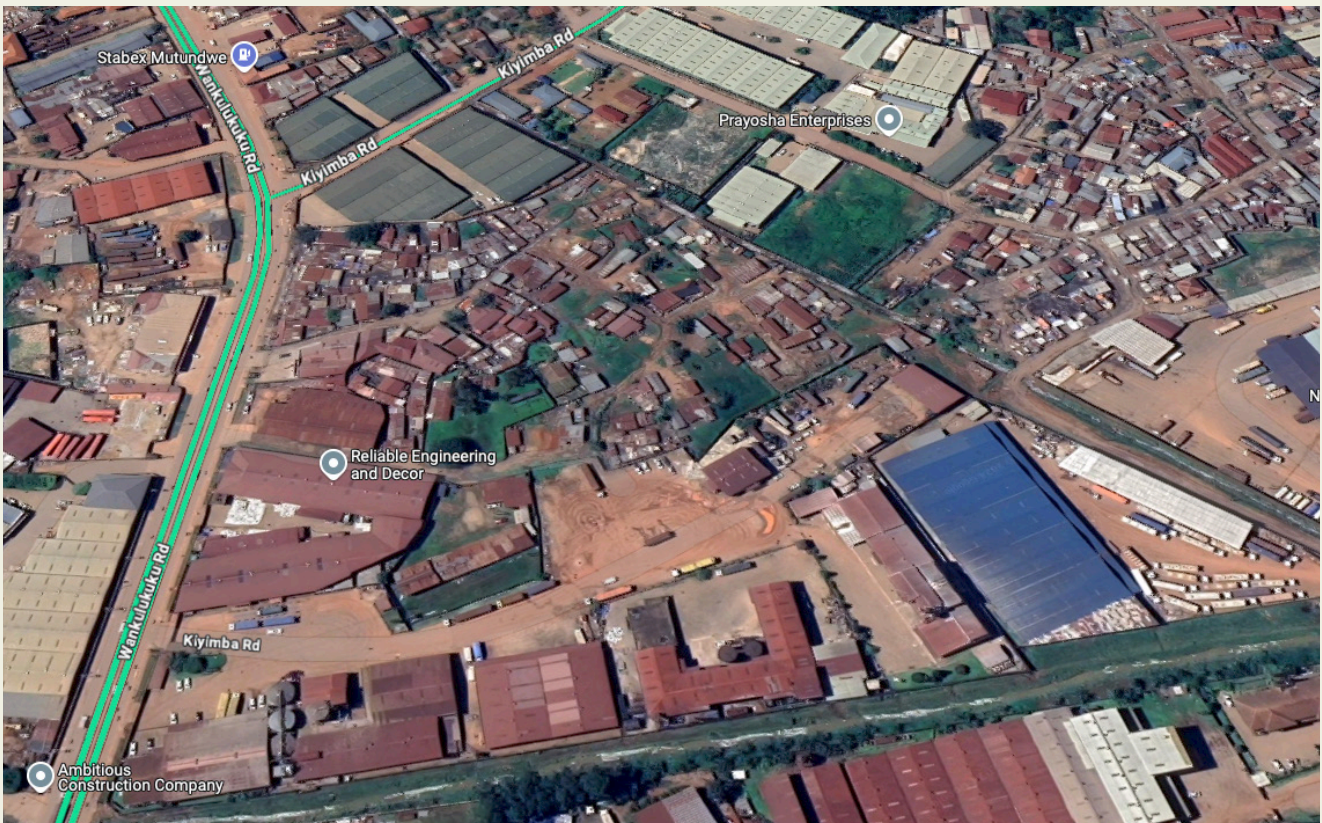
Overview of the Nalukolongo Industrial Area