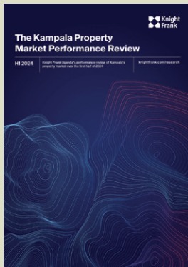
The Kampala Property Market Performance Review H1 2024