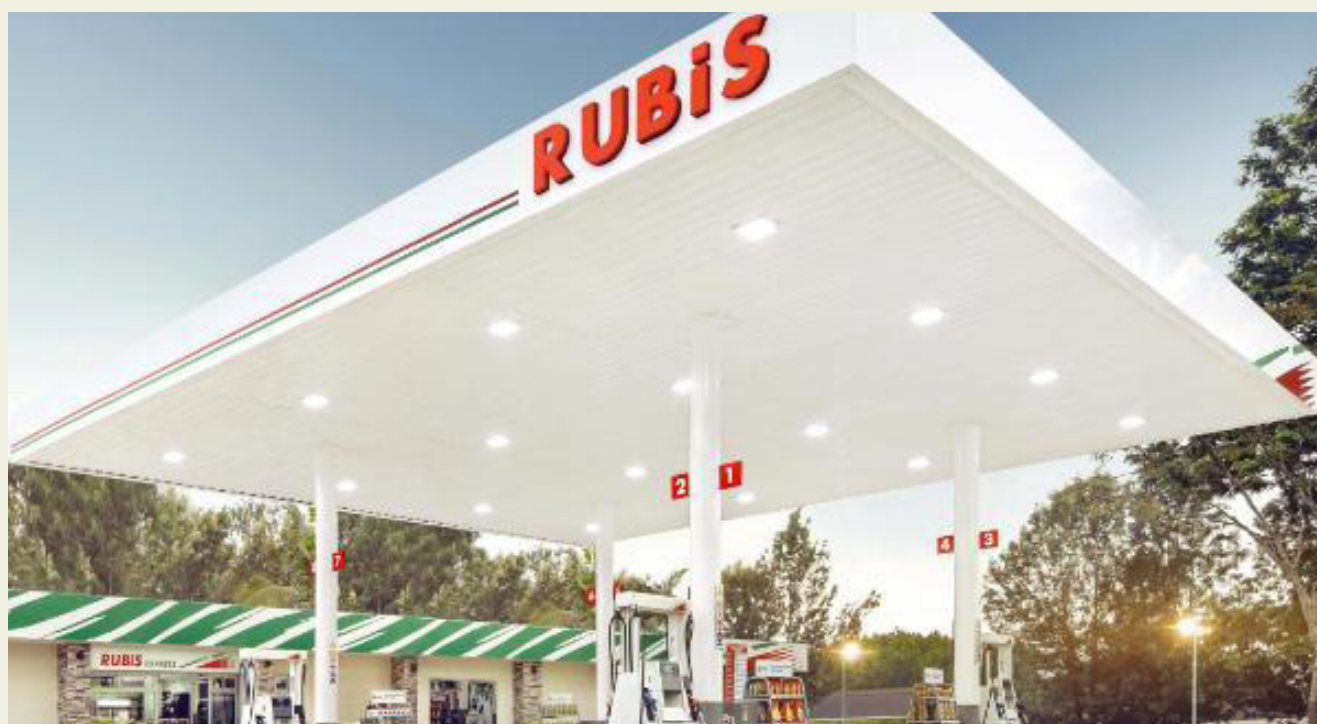
Rubis Energy Nalukolongo