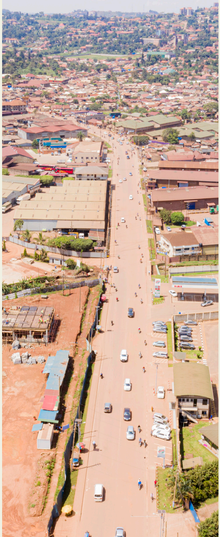
Outline of Wankulunkuku Road with adjacent view of Nalukolongo industrial Area.