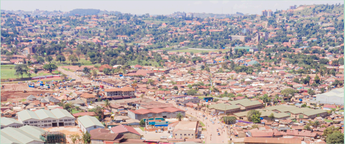
Aerial photo of a section of Nalukolongo Industrial Area