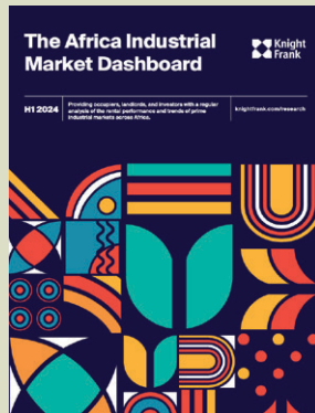
Africa Industrial Market Dashboard H1 2024