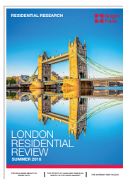
The London Review – Summer 2018