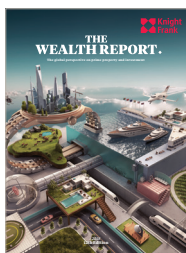
The Wealth Report – 2018