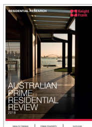
Australia Prime Residential Review – 2018