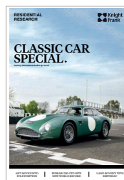
Luxury Investment Index – Q1 2018

Knight Frank Research Reports are available at KnightFrank.com/Research