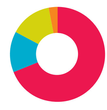
Figure 1 Where do our buyers come from? Buyers, past 12 months