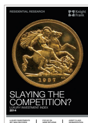
Luxury Investment Index 2014

Knight Frank Research Reports are available at KnightFrank.com/Research