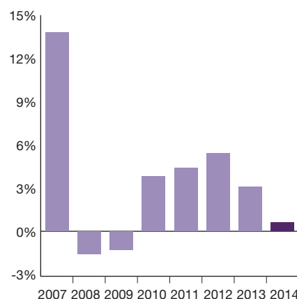
FIGURE 1 Index performance Unweighted annual % change in prime rents

Source and notes: see main table of results