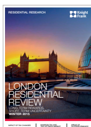
The London Review - Winter 2015