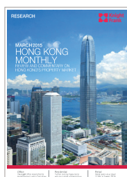
Hong Kong Monthly - March 2015