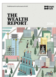
The Wealth Report 2015