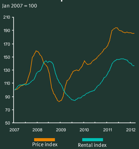
Luxury residential prices and rents Jan 2007 = 100