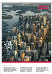
Sydney CBD Office Market Overview March 2017