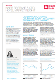
Inner Brisbane & CBD Hotel Market Insight March 2017