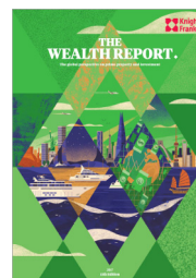
The Wealth Report 2017

Knight Frank Research Reports are available at KnightFrank.com.au/Research