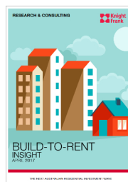
Build-To-Rent Insight April 2017