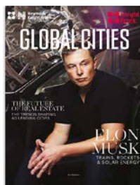
Global Cities 2018