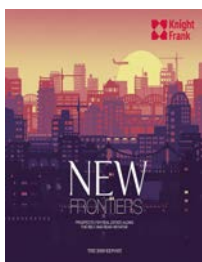
New Frontiers 2018