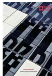
Consultancy & Research Brochure