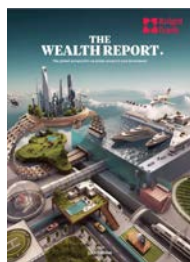
The Wealth Report 2018