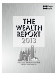
The Wealth Report 2013