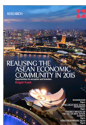
Realising the ASEAN Economic Community in 2015