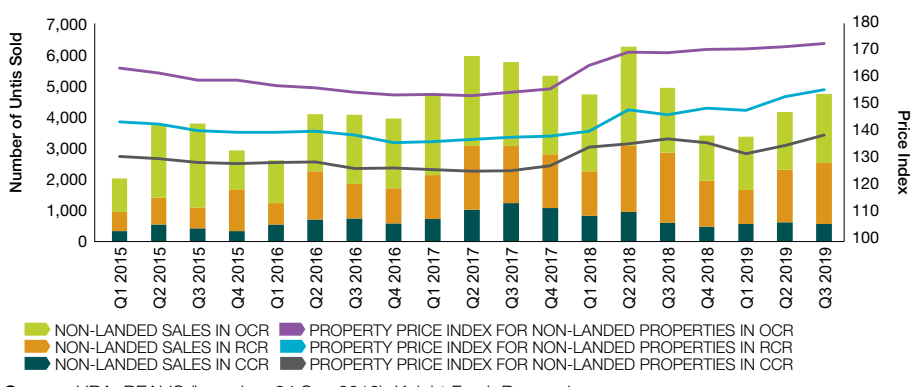
EXHIBIT 2 URA Private Residential Price Indices and Number of Units Sold by Market Segment

Source: URA, REALIS (based on 24 Sep 2019), Knight Frank Research