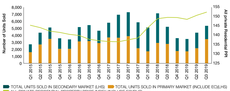
EXHIBIT 1 Total Units Sold in Primary and Secondary Markets, and URA Private Residential Property Price Index

ALL PRIVATE RESIDENTIAL PROPERTY PRICE INDEX (INCLUDE EC)(RHS)