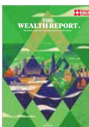
The Wealth Report 2017