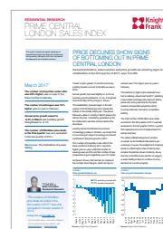
Prime Central London Sales Index - Mar 2017