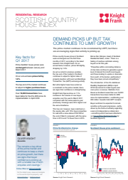
Scottish Country House Index Q1 2017