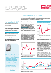
UK Residential Market Update - Mar 2017