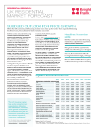
UK Housing Market Forecast - Nov 2016