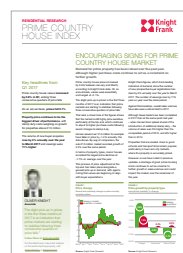
Prime Country House Index Q1 2017