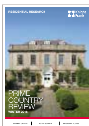
UK Prime Country Review - Winter 2016