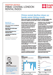
Prime Central London Rental Index Dec 2013