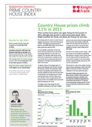
UK Prime Country House Index Q4 2013