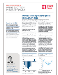
Prime Scottish Property Index Q4