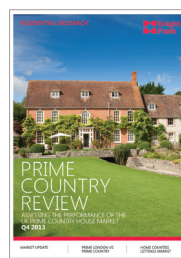
Prime Country Review Q4 2013