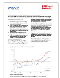
House Price Sentiment Index (HPSI) Dec 13

Knight Frank Research Reports are available at KnightFrank.com/Research