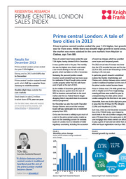
Prime Central London Sales Index Dec 2013