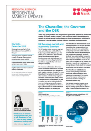
UK Residential Market Update December 2013