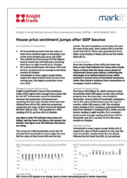
Knight Frank/Markit's HPSI November 2012