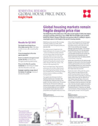
Prime Global Rental Index Q2 2012

Knight Frank Research Reports are available at www.KnightFrank.com/Research