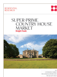
Super-Prime Country House Market Report 2012