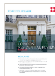
The London Review Autumn 2012