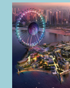
UPCOMING PROJECT: Bluewaters Island

School (Regent International School) 11 minutes (7.6 km)